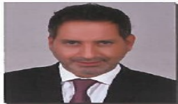
FRIDAY NIGHT Amir Yazbeck (Lebanese Singer)