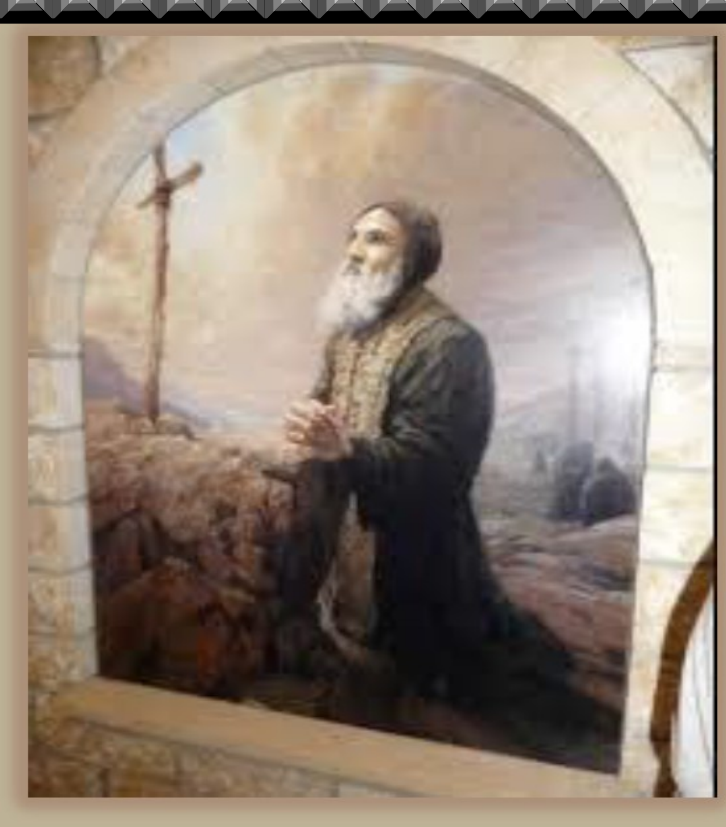
«YOU HAVE UNITED, O LORD, YOUR DIVINITY WITH OUR HUMANITY AND OUR HUMANITY WITH YOUR DIVINITY»

For Concelebrating Clergy: White vestments are requested