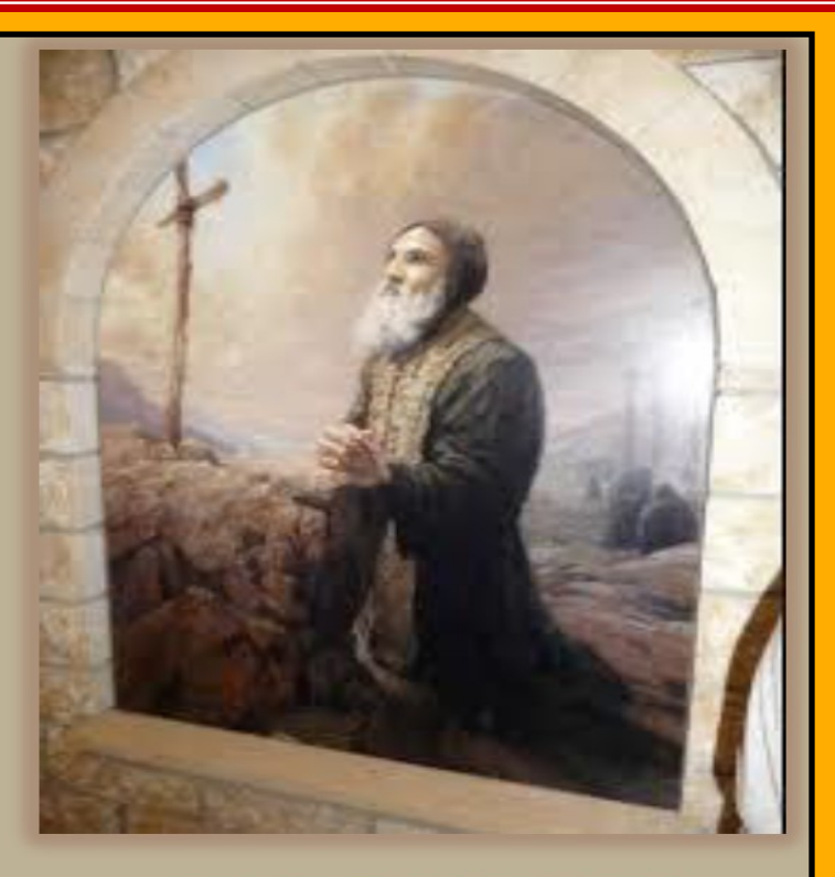
«YOU HAVE UNITED, O LORD, YOUR DIVINITY WITH OUR HUMANITY AND OUR HUMANITY WITH YOUR DIVINITY» - Maronite Divine Liturgy

For Concelebrating Clergy: White vestments are requested