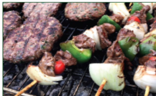
Grilled Meats and More ...